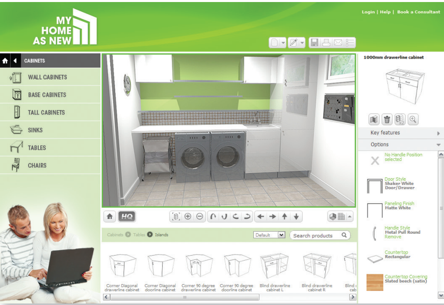
2020 Virtual Planner integrates easily into a retailer’s online presence and sales process.