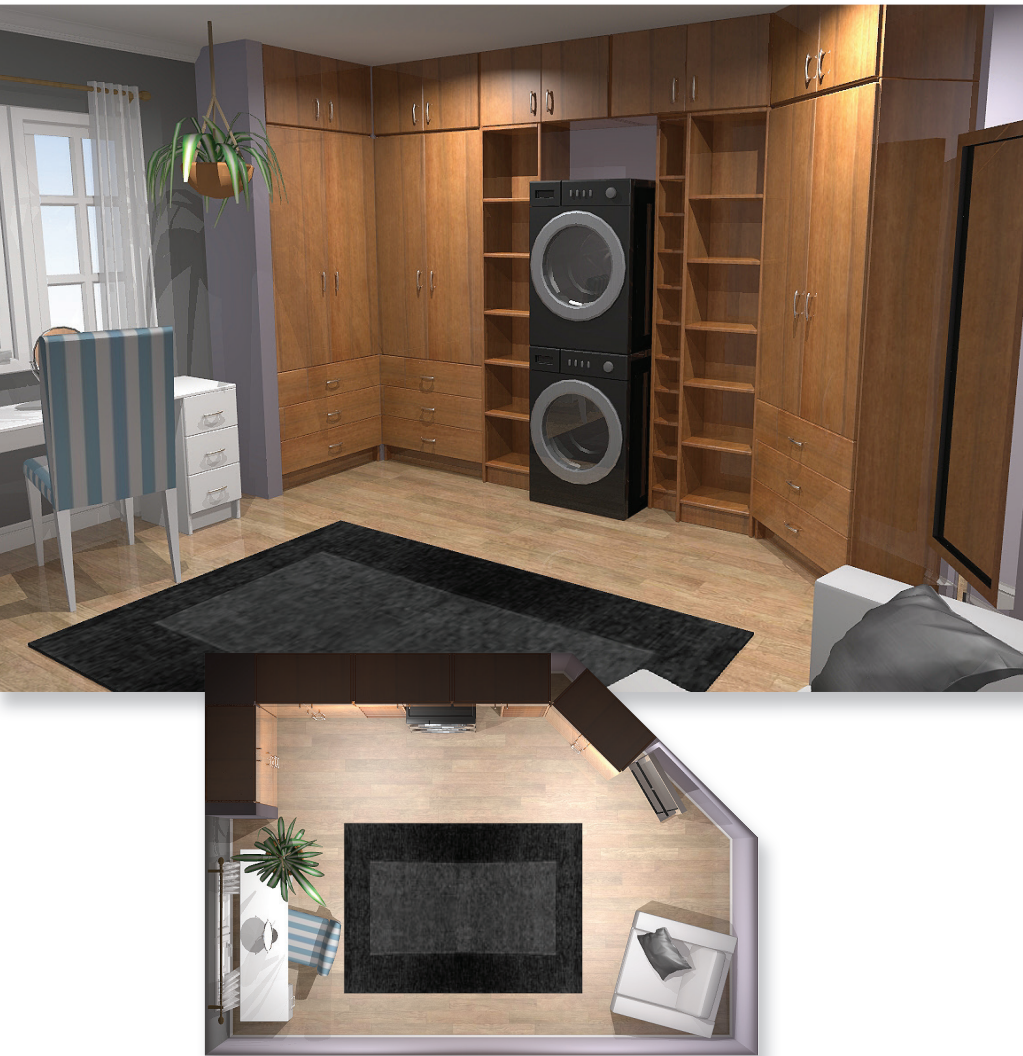
Consumers see a full-color, 3D design of their own rooms, with your products and your corporate brand.

2020 Virtual Planner is sophisticated enough for creating beautiful looking results, and yet simple enough for your typical shopper to use. It’s made to assist the consumer as they design their own spaces, ensuring that products fit together properly within the design space.