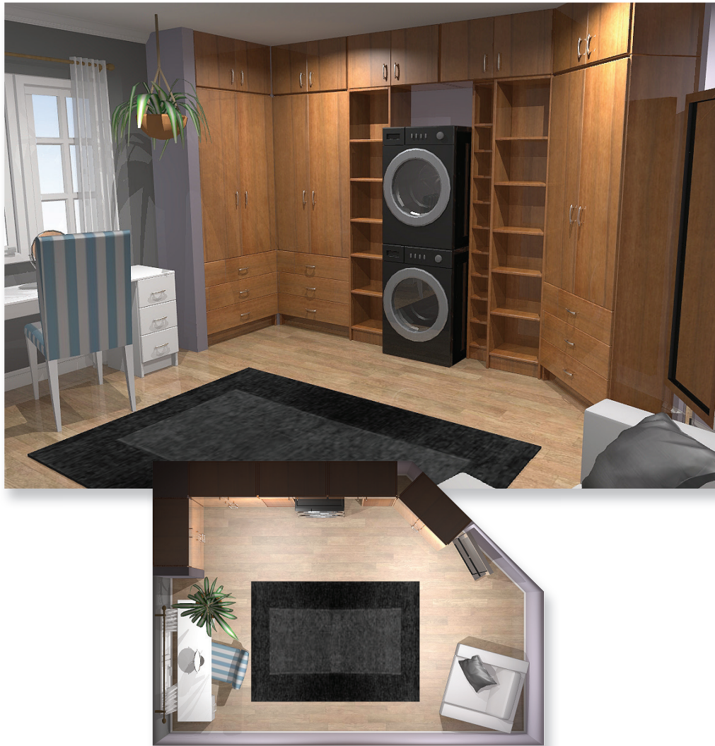
Consumers see a full-color, 3D design of their own rooms, with your products and your corporate brand.

2020 Virtual Planner is sophisticated enough for creating beautiful looking results, and yet simple enough for your typical shopper to use. It's made to assist the consumer as they design their own spaces, ensuring that products fit together properly within the design space.