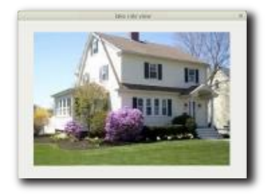
Easily integrate photos or 360 tours of your properties